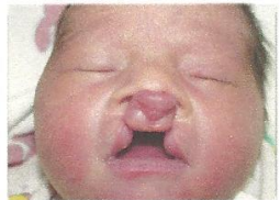
Baby girl before surgery