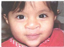
One year after surgery